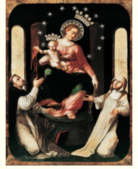
Our Lady at Fatima

The word Rosary means "Crown of Roses". Our Lady has revealed to several people that each time they say a Hail Mary they are giving her a beautiful rose and that each complete Rosary makes her a crown of roses. The rose is the queen of flowers, and so the Rosary is the rose of all devotions and it is therefore the most important one. The Holy Rosary is considered a perfect prayer because within it lies the awesome story of our salvation. With the Rosary in fact we meditate the mysteries of joy, of sorrow and the glory of Jesus and Mary. It's a simple prayer, humble so much like Mary. It's a prayer we can all say together with Her, the Mother of God. With the Hail Mary we invite Her to pray for us.